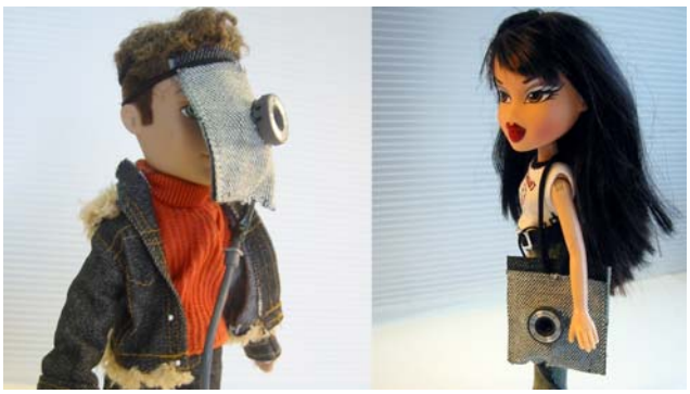
Figure 5. 5a: the camera man toy vs 5b: the actor

At 6 years old, when the child was asked to play with one doll, the doll being exclusively a camera person, there was no confusion for the child. The preview with one doll captivated the attention of the child as she mastered the interaction. The child first focused on discovering visual perspectives and later used the doll to record a video. As she was introduced to the second doll, the child simply took the bag that contained the camera and brought it onto the other toy to repeat the same interaction. She held one toy in each hand, but only one doll was the camera person. Children under six years old could not properly de-couple between the toy as a camera person (see figure 5a) and the same toy not being a camera person anymore (see figure 5b); it was challenging enough to discover the world through the eye of one toy. Continuing with this interaction, the 6 years old child could go in record mode and record the video of "the doll who wants to be in the movie". The child played back her story by moving the two toys horizontally together.