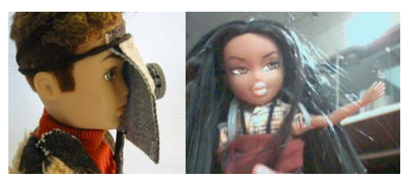
Figure 2. The toy is the camera person (2a) vs what the toy "sees" from "his" video feed (2b).

We designed Picture This! so that the child's toy becomes a camera person as opposed to having the child hold a camera directly (see figure 2a). As a child plays with the toy that holds the camera, its video feed is projected on a screen in front of her in real time (see figure 2b). This visual flow aims to motivate her in composing a final movie as she plays and explores her visual story.